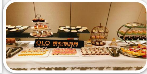
(The pictures are for reference only)