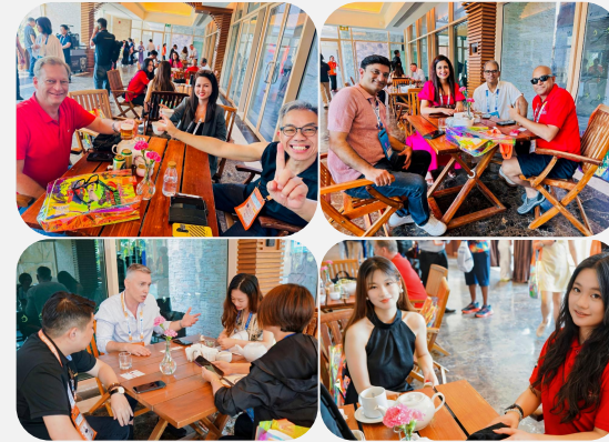
(The pictures are for reference only)