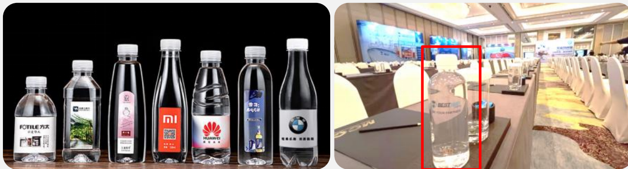
(The pictures are for reference only)